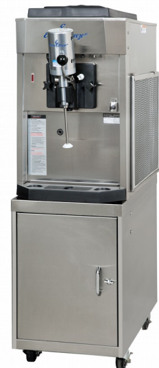
Available as a floor Standing Machine (CS700/F)