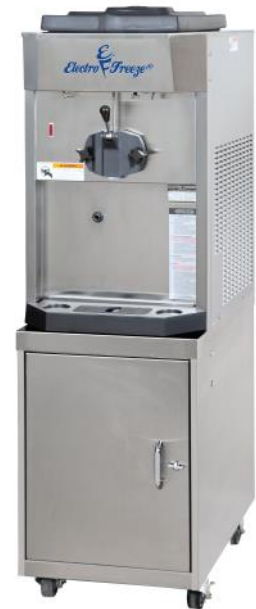
Floor Standing CS600/F